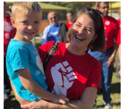
Member at May Day 2018

On a more positive note, however, it was heartening to see the minimum wage increased by 3.5% on Friday.